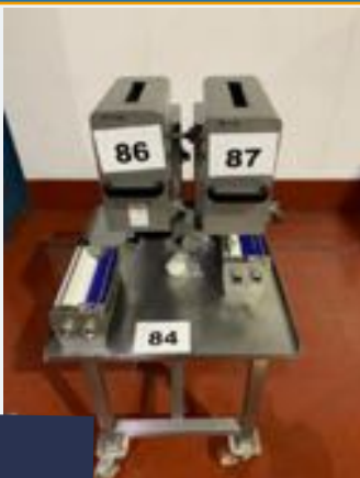
TABLE TOP TENDERISER.