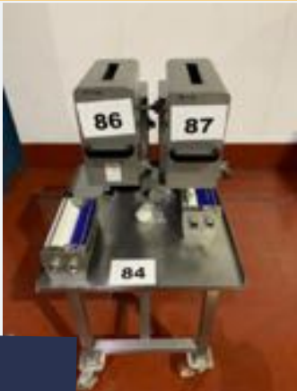
TABLE TOP TENDERISER.