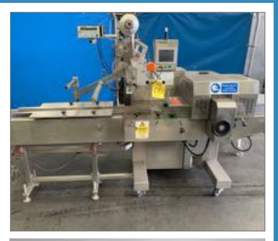
REDPACK P200ESS FLOWRAPPER.