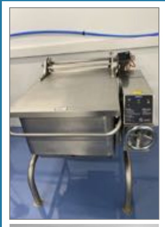
GROEN ECLIPSE BRATT PAN.