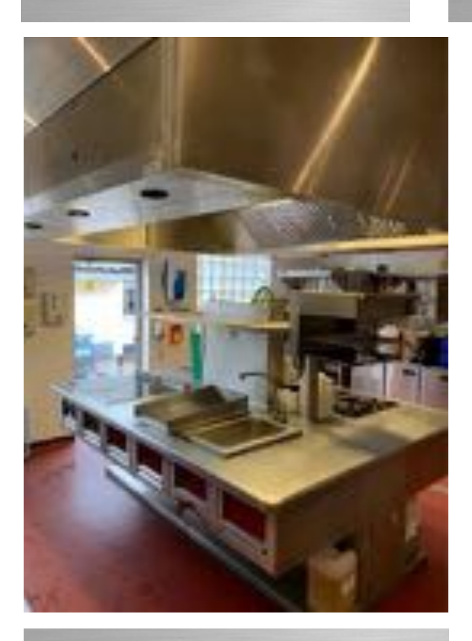
CHARVET PROFESSIONAL COOK SUITE.