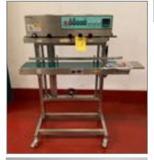
VERTICAL BAG SEALER.