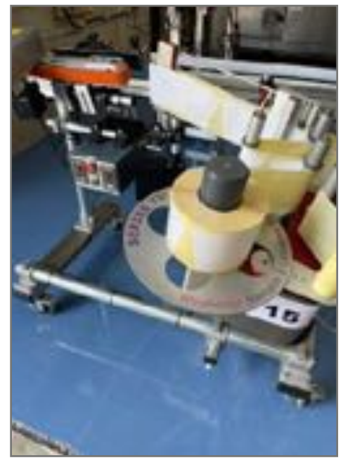
WEYFRINGE SIDE LABELLER.