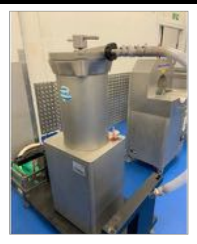
RAMON SC400 SAUSAGE FILLER.