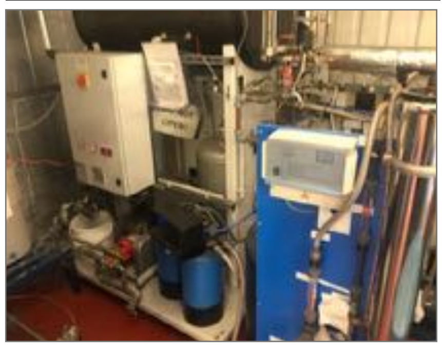
CERTUSS JUNIOR STEAM GENERATOR.