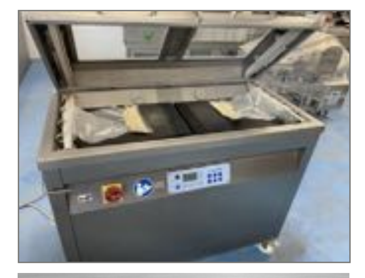
MULTIVAC C370 VAC PACKER.