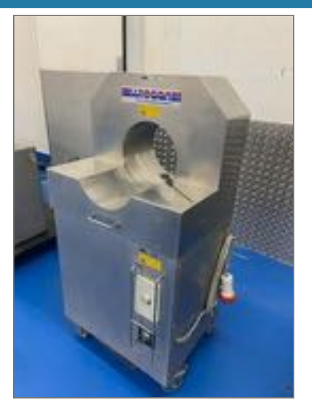
WIEGAND R30E STRINGING MACHINE