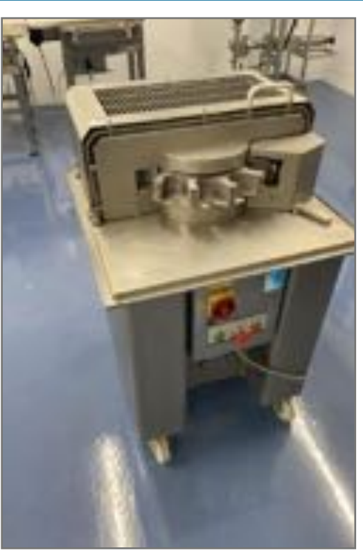
AFT TOMATO/EGG SLICER.